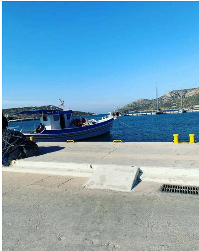
Lipsi Travel Services